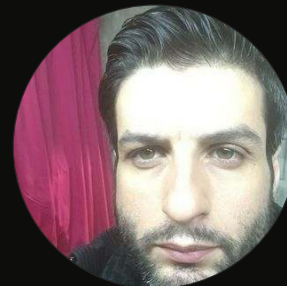
Mohamad Assaf IMDb IG Capernaum · Al Hayba