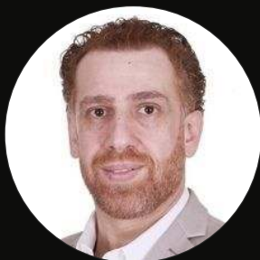
Shady Ardati IMDb Theatre