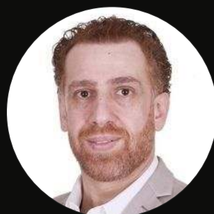
Shady Ardati IMDb THEATRE