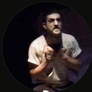
Tarek Hakmi IMDb IG VALLEY OF EXILE