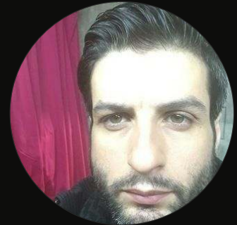
Mohamad Assaf IMDb IG CAPERNAUM · AL HAYBA