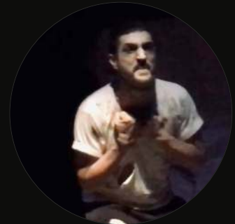
Tarek Hakmi IMDb IG VALLEY OF EXILE