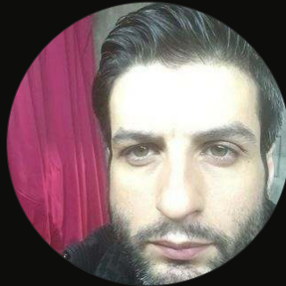
Mohamad Assaf IMDb IG