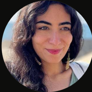
Yara Zakhour IMDb IG