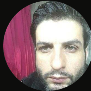
Mohamad Assaf IMDb IG CAPERNAUM · AL HAYBA