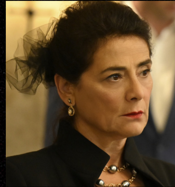
Hiam Abbass Magdaline Barakat