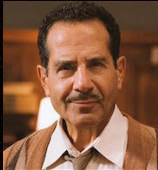
Tony Shalhoub Fredric “The Baker” Barakat